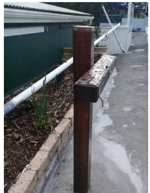
The base for the new flagpole waiting.....